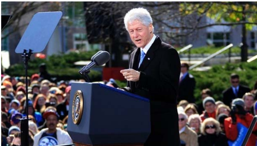
VIEW LARGE >>

GREENVILLE, S.C. — Tickets to for an Evening with Bill Clinton are schedule to go on sale Wednesday, March 12.